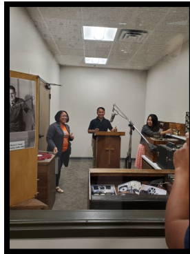
Bishop Bacus of the Philippines inside L&L Hour Studio

Making the rich collection accessible to the global church is a major focus as we are “Mining the past to shape the future”!