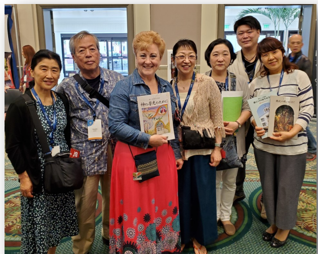
Japan FMC deposits local church history for FM Archive. GC19

“Conserving the legacy of the Free Methodist Church as a resource for its identity and future”