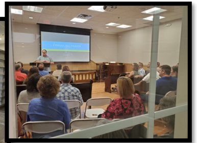
Starting Strong members in the Zahniser Chapel